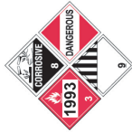
Some Common Placards

Placards should be on all four sides of the vehicle. For containers with bulk packages inside, if the required ID# marking is not visible, the transport vehicle must be marked on each side and each end. Some Common Placards